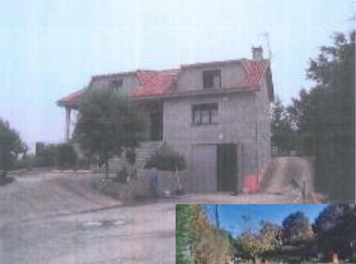
antes da demolición